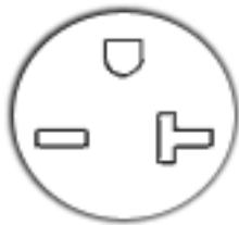
Nema (6-20) Outlet